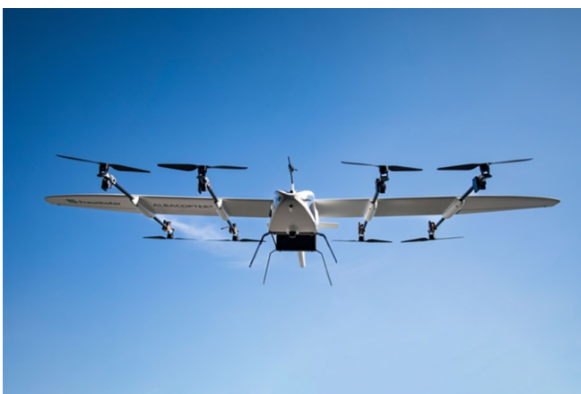
Fig. 1 The ALBACOPTER® – a cross between a multicopter and a glider

The consortium will be presenting some initial highlights at the IAA Mobility trade show in Munich in Hall B1, Booth D11, from September 5 to 8, 2023.